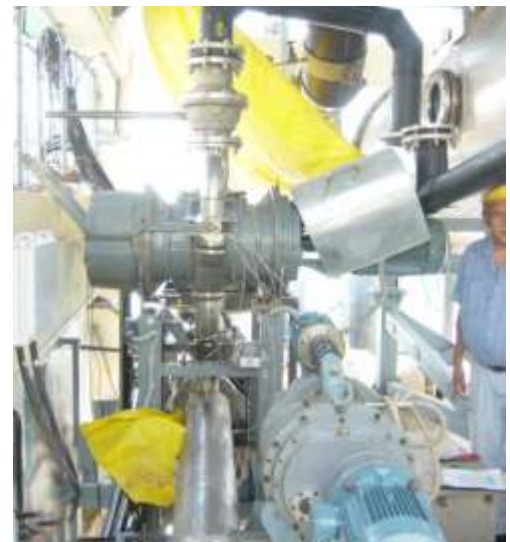
Vacuum systems for LTTD

LTTD method of producing fresh water from sea water consists of flash evaporator, main condenser, fresh water & warm water pump and a vacuum pumping system. Since the major equipment is static the entire project requires low maintenance, having long operational life (Refer schematic diagram). The surface sea water is pumped into the flash chamber where low pressure is maintained. Almost 1 % of water is evaporated in the flash chamber and the rest of the water freely flows back into the sea as the flash chamber is maintained at a barometric height. The vapours evaporated in the flash chamber are driven over the main shell & tube condenser and almost all of them are condensed. The cold source of water pumped from lower layers of the sea takes away the condenser heat. The discharge water of the condenser, available at about 17°-18°C, can be used for other cooling applications such as air conditioning etc before discharging back into the sea. During the process of evaporation non condensable gases released from the sea water & the plant leakage load are constantly pumped by a