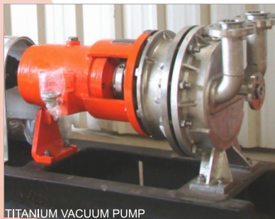
TITANIUM VACUUM PUMP

86/1, Vengaiwasal Main Road, Gowrivakkam, Chennai 600 073, India. Ph : +91 44 22780211 / 0212 / 1210 Fax : +91 22 22780209 / 1120 E-mail : rotodynamic@titanindia.com