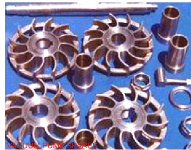
VACUUM PUMP SPARE