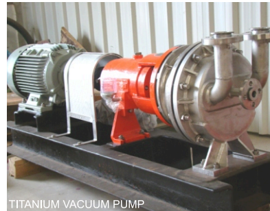
TITANIUM VACUUM PUMP