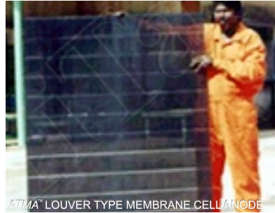
ATMA™ LOUVER TYPE MEMBRANE CELL ANODE