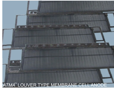
ATMA™ LOUVER TYPE MEMBRANE CELL ANODE