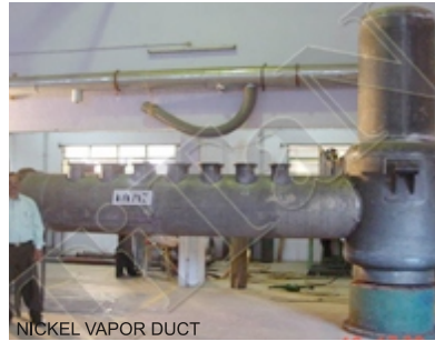
NICKEL VAPOR DUCT