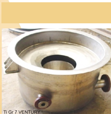
Ti Gr 7 VENTURY

Pickling is the final treatment of iron and steel products before onward sale.