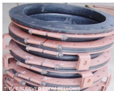
Ti Gr 7 SLEEVED EPDM BELLOWS