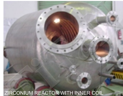
ZIRCONIUM REACTOR WITH INNER COIL