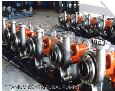
TITANIUM CENTRIFUGAL PUMPS