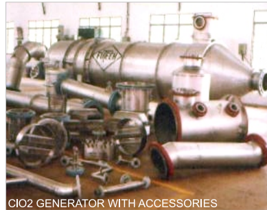
ClO 2 GENERATOR WITH ACCESSORIES