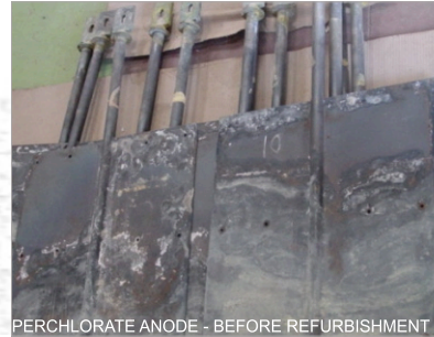
PERCHLORATE ANODE - BEFORE REFRUBISHMENT