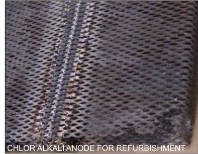
CHLOR ALKALI ANODE FOR REFRUBISHMENT