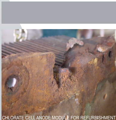
CHLORATE CELL ANODE MODULE FOR REFRUBISHMENT